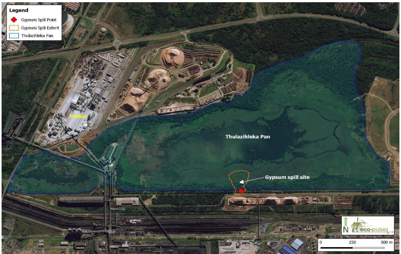
Figure 2: Map indicating incident site

The incident site is located next to the IDZ site just behind Transnet National Port Authority. On the route from Foskor to the Pump Station.